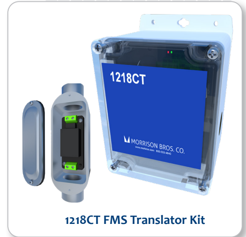
1218CT FMS Translator Kit

Enclosure: Meets NEMA 1, 2, 4, 4X, 12 and 13 specifications; UL Listed to UL508-4x specifications (File E194432); meets IP65 and IP66 specifications.