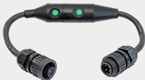
Break Away Connector